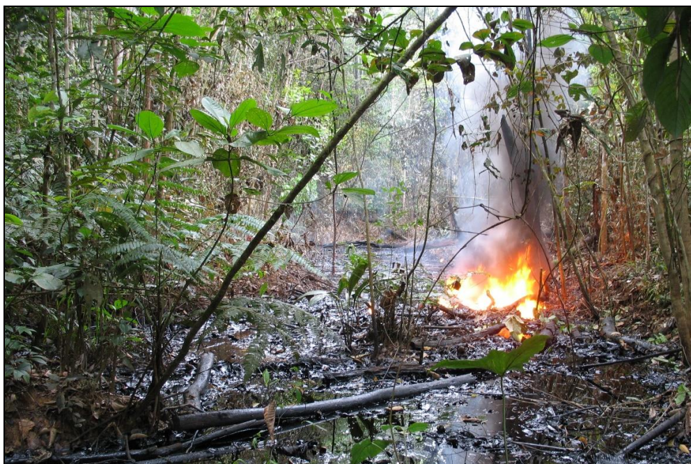
Burning oil spilled as a remediation technique. Jibarito Battery. Corrientes River.

4. The lack of environmental remediation. The few remedial actions the company has taken have been mainly bad practices, such as: burning the spills or burying the oil in the ground.