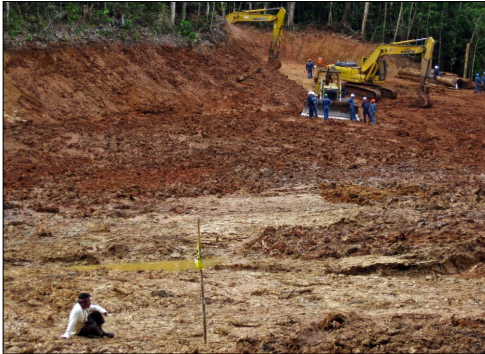
What was left of the Shanshococho lake after the company “remediated” it. Pastaza river.

b. Block 8: Legal obstruction of its obligation to repair Yanayaku battery 11 . The Yanayaku battery has an environmental management instrument presented by Pluspetrol and approved by the Peruvian government that provides different mechanisms of environmental remediation in case of contingency or accident, namely a Decontamination Plan. Pluspetrol requested modification to the Decontamination Plan, which were rejected by Peru. In 2009, with evidence that the area of the battery was highly contaminated, the Peru forced the company to implement this environmental instrument. Pluspetrol, however, challenged the agreed upon Decontamination Plan in the courts. The company claimed that it had now been proven that “natural remediation or regeneration” - that is, doing nothing - was the best technique that should be applied to the area. At present, the Yanayaku area still does not have any type of environmental remediation.