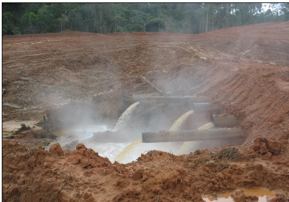
Formation waters from the Jibarito battery dumped at the Pucacungayacu river, stream of the Corrientes River.

1. Dumping the formation waters (highly contaminating): Until 2009, the company poured the formation waters directly into the main water sources of the communities and area rivers.