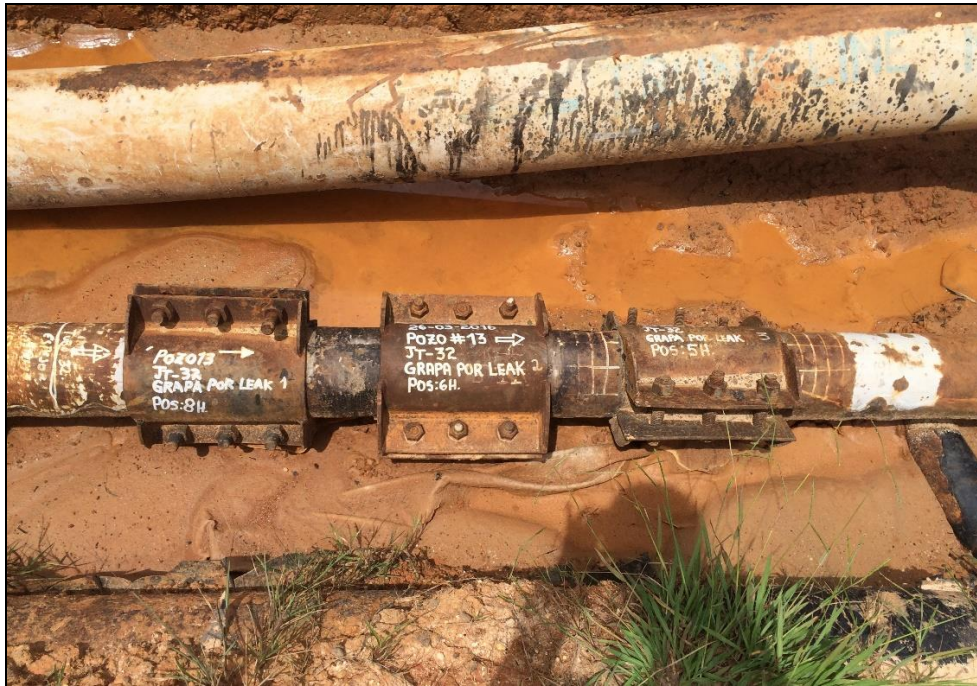
Clamps on the pipelines after leaks have happened. Tigre river. (PUINAMUDT/EQUIDAD)

3. The poor state of infrastructure and oil pipelines that have not been replaced in the last 45 years.