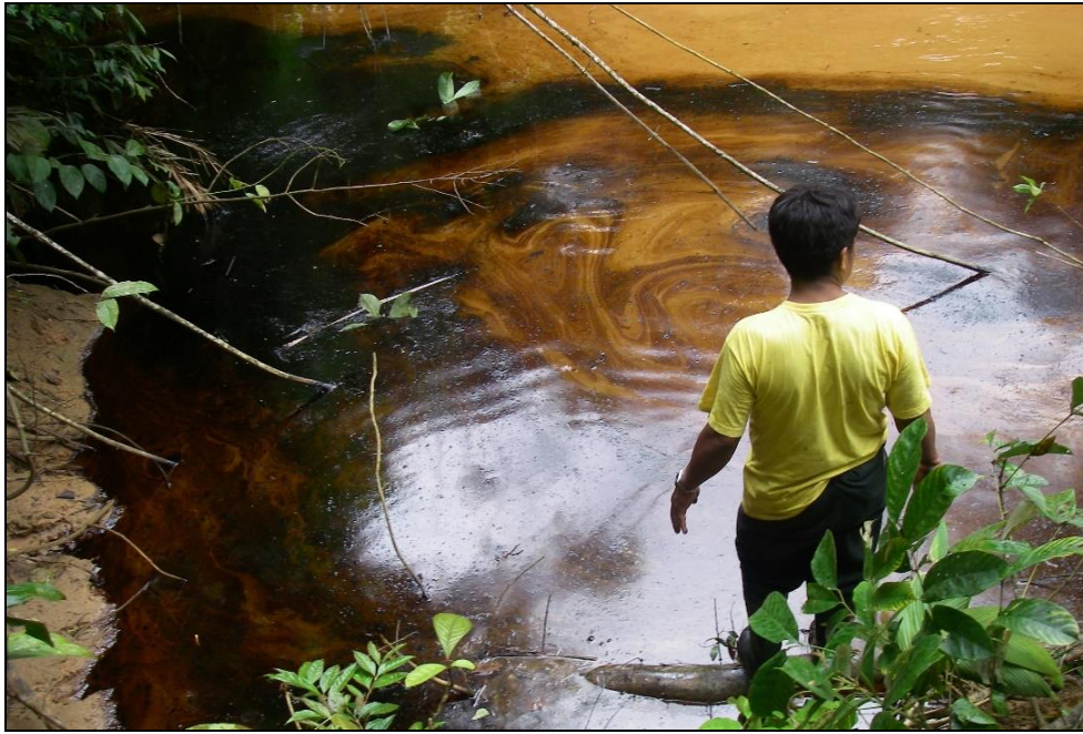
Spill in the Marañon River.