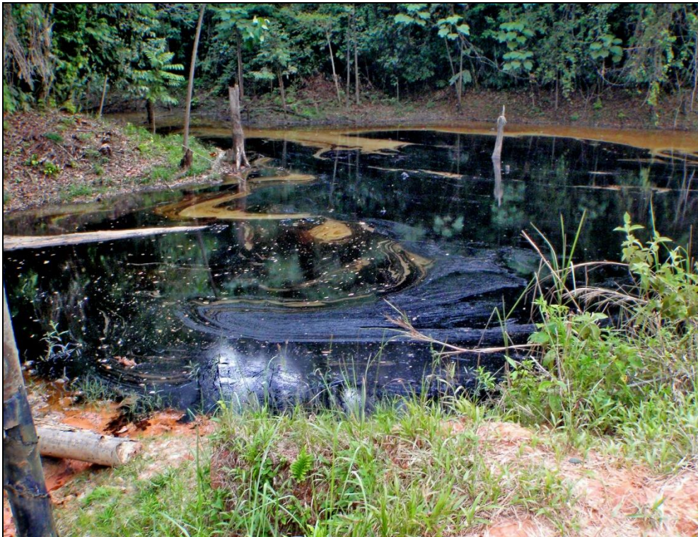
Spill in the Corrientes river basin. (PUINAMUDT)