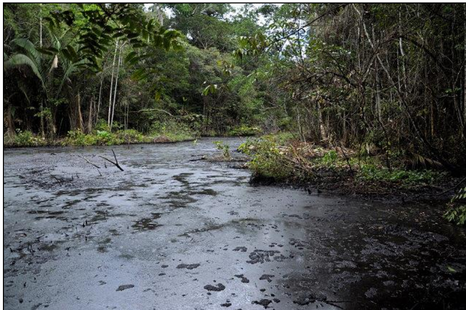
Shanshoccha Lake flooded with oil. Pastaza river. 2012.

a. Block 1AB / 192: Sansococcha lake/lagoon: In 2012, before the arrival of a Congressional Commission of the Republic to the area, indigenous organizations and their environmental monitors denounced the existence of a lagoon completely covered with oil. Given this situation, the company, without prior notice to Peru as was its obligation, decided to “remedy” the lake by making it disappear. Pluspetrol cleared the area and drained the lagoon illegally 10 . The practice of “hiding” pollution by Pluspetrol has been denounced by indigenous environmental monitors successive times.