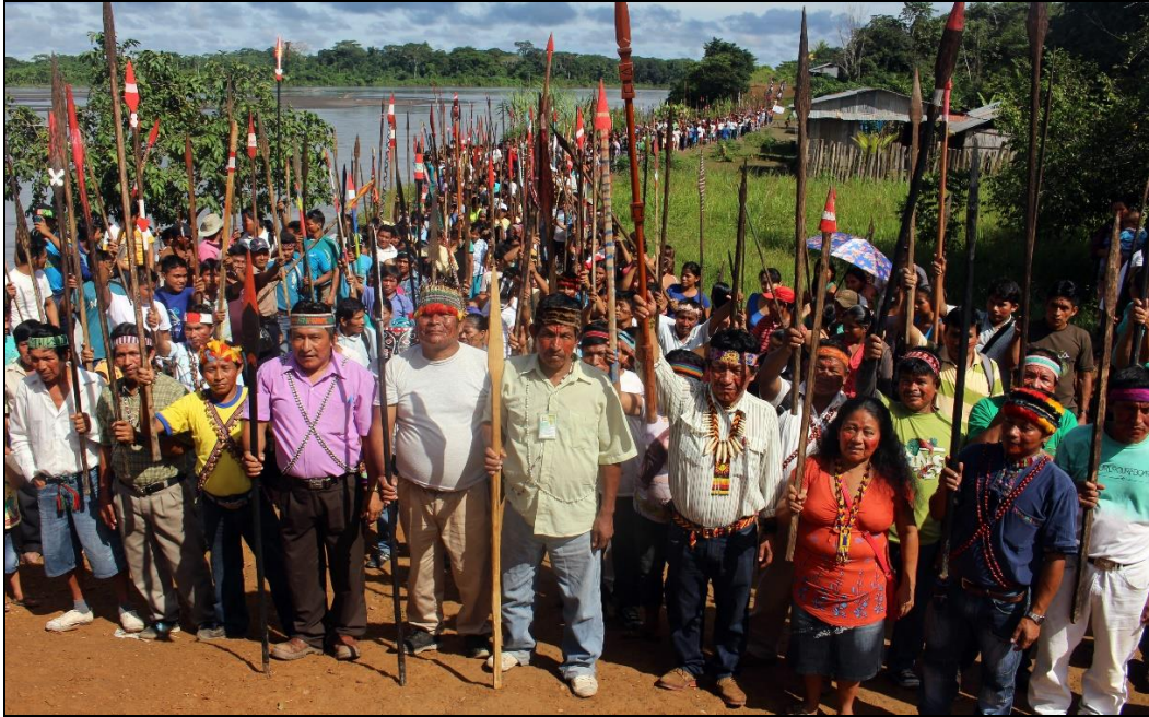
Quechua indigenous peoples protest in Pastaza river. (PUINAMUDT)