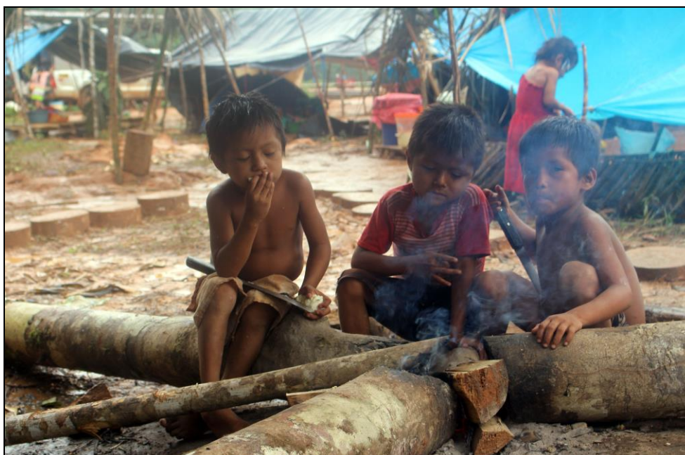
Kichwa children eatin yucca. Tigre river. (PUINAMUDT)

16. The affected communities' basic sources of water and food are contaminated. Prior to 2016, only two health studies had been carried out by the State, in 2005 and 2006, but limited exclusively in five communities on the Corrientes River. The 2005 study showed that 66.21 per cent of children under 18 exceeded the established limit for lead in children and for the presence of cadmium, it was 98.65 per cent that the percentage of the population under 18 years of age exceeds Values of cadmium in blood. These studies did not involve State action aimed at mitigating and monitoring the implications of these results.