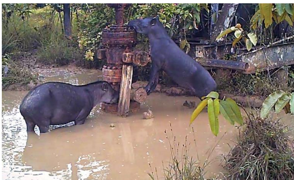
Sachavacas eating oil (they mistake it with collpas or natural salt resources).

16. The affected communities' basic sources of water and food are contaminated. Prior to 2016, only two health studies had been carried out by the State, in 2005 and 2006, but limited exclusively in five communities on the Corrientes River. The 2005 study showed that 66.21 per cent of children under 18 exceeded the established limit for lead in children and for the presence of cadmium, it was 98.65 per cent that the percentage of the population under 18 years of age exceeds Values of cadmium in blood. These studies did not involve State action aimed at mitigating and monitoring the implications of these results.