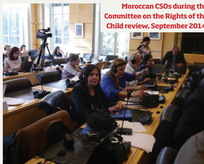
Moroccan CSOs during the Committee on the Rights of the Child review, September 2014.

The cycle begins with the submission by the State of its report on how it respects, protects and fulfils the particular treaty to the Office of the United Nations High Commissioner for Human Rights (OHCHR) or the regional human rights body. On the basis of this report the Committee prepares a list of questions, called “list of issues”, requesting more information from the State. The government is invited to provide written responses to the list. Next, a public dialogue between committee members and representatives of the government takes place. On the basis of that exchange, the Committee adopts so-called concluding observations and makes recommendations on action to be taken by the State. Following this process, a next important step is the follow-up of the implementation